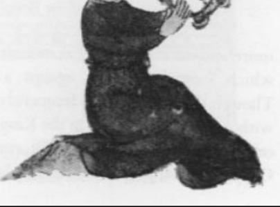
Figure 3 —Woman playing tambourine from early 14<sup>th</sup> century English Book of Hours (Blades, Montagu, Percussion Instruments 14). This shows ecclesiastical use less than 50 years after the Crusades.

Further examinations of early Middle Ages iconography show strong evidence for the tambourine's inclusion in liturgical concerted music. "In the psalters...there is usually an introductory picture, often illustrating King David and his musicians.... There are frequently illustrations showing musicians accompanying, particularly, Psalms 81 [and 149] (...timbrel [tambourine], harp, psaltery, trumpet), and 150 (...trumpet, psaltery, harp, timbrel [tambourine], stringed instruments, organs, cymbals)" (Montagu, Medieval Instruments 15). In fact, the tambourine may have been an accepted element of liturgical music as early as the late 13<sup>th</sup> century. Figure 2 shows "the label-mould carvings (c. 1290-1315, Guild of Musicians) in Beverly Minster...[which illustrate] a remarkably clear representation of...a player on the tambourine" (Blades, Montagu, Percussion Instruments 3). Further, an early 14<sup>th</sup> century illustration from the English Book of Hours (Figure 3) shows a woman playing the tambourine (Blades, Montagu, Percussion Instruments 14). It is